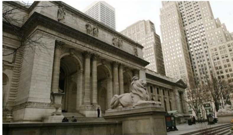
The New York Public Library tops the list of library trusts