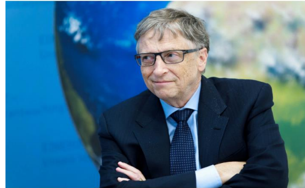
Bill Gates in February.

Last year, as Kalamazoo, Mich., struggled with a budget deficit and other economic woes, two local philanthropists stepped forward, pledging $70 million to improve the city's fortunes. Earlier in 2016, a group of foundations put up even more money to help another troubled Michigan city, Flint, recover from the contamination of its water supply. And a few years before that, foundations helped to rescue Detroit from bankruptcy.